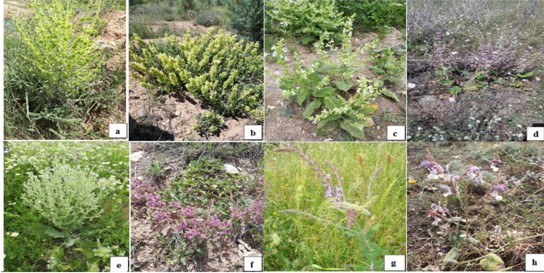
Figure 1. Salvia ceratophylla (a), S. absconditiflora (b), S. syriaca (c), S. sclarea (d), S. aethiopsis (e), S. bracteata (f), S. virgata (g), S. cyanescens (h)

syriaca L., Salvia ceratophylla L., Salvia bracteata Banks et Sol., Salvia cyanescens Boiss. & Bal., Salvia sclarea L. and Salvia virgata Jacq. species spread naturally in Kırşehir city (Figure 1). Table 1 shows the information on the locations where the species spread.