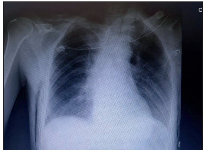
Figure 2: Subcutaneous emphysema.