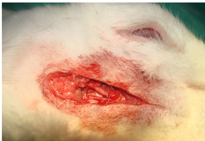
Figure 1. Exposure of the buccal branch of CNVII