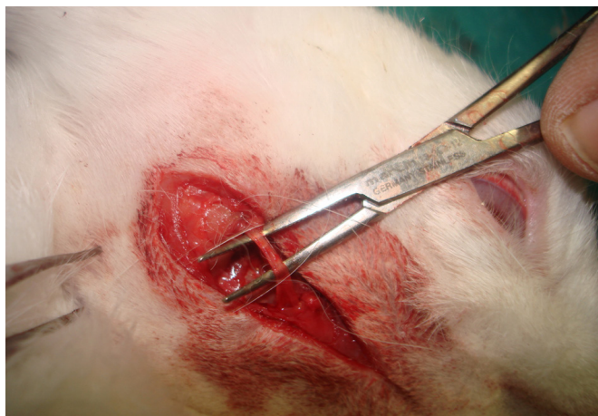
Figure 2. Dissection of the buccal branch of CNVII