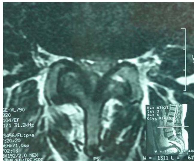
Figure 2: T2 weighted MRI image on axial plane.