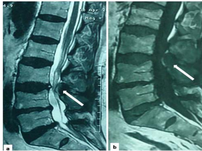
Figure 1a&b: T2 and T1 weighted MRI images on sagittal plane, white arrows indicating a circumscribed lesion.